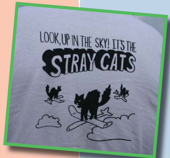
The team logo for the winning Catapult Glider team.