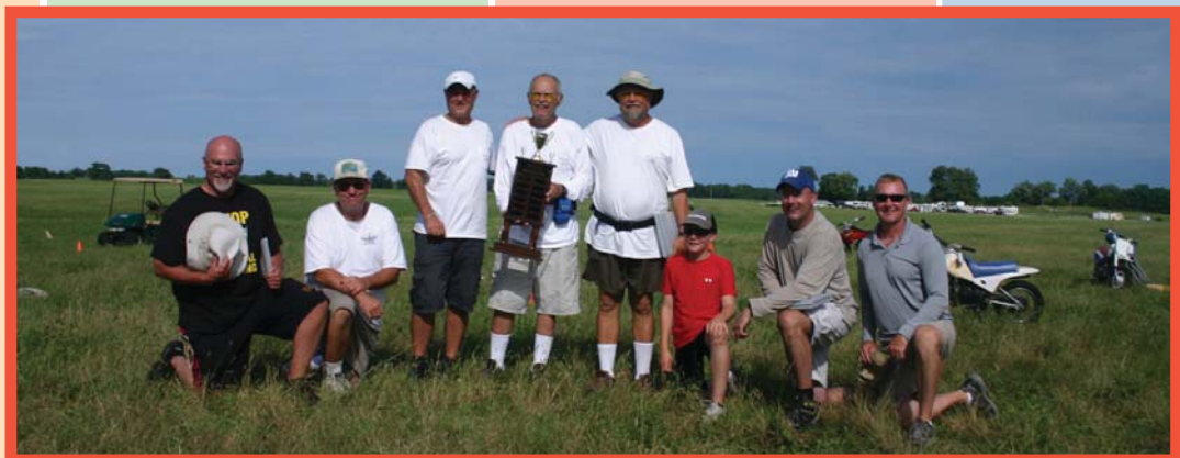
The top three teams in Team Catapult.