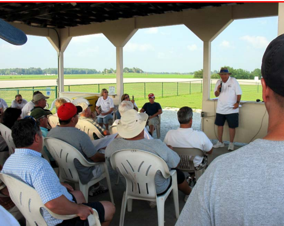
Sunday evening's pilots' meeting at the pavilion on the International Aeromodeling Center in Muncie, Indiana, was well attended.

much missed friendships and acquaintances.