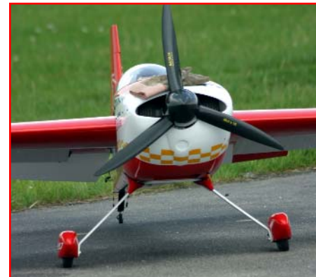
The Carden aircraft were popular at last year's Nats.