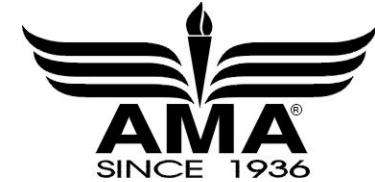
2006 Financial Insurance Summary