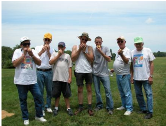
Some of the Club members in 2003, doing what they do best at the Club flying field, eating hot dogs.

This PDF is property of the Academy of Model Aeronautics. Permission must be granted by the AMA History Project for any reprint or duplication for public use.