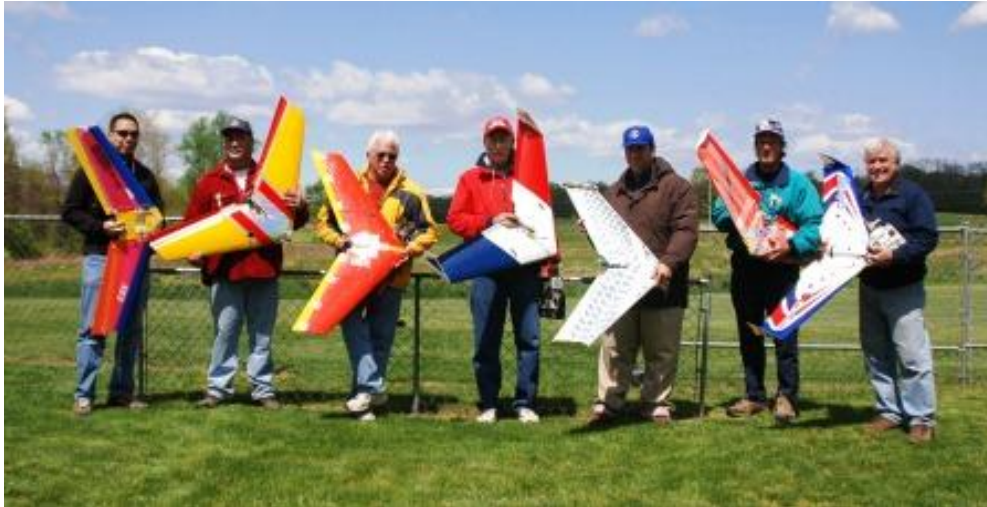
Some of the Club members in 2007, with their flying wings.