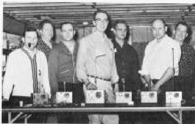
Seven of our hard-working modelers at the District Builders' Meeting on March 29.