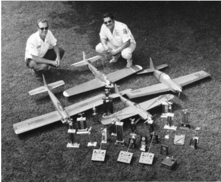
Two of the Club members with trophies they won.