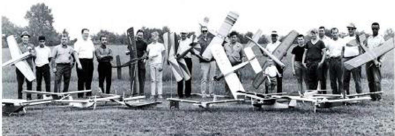
1966: A group shot of the Monmouth Model Airplane Club members.