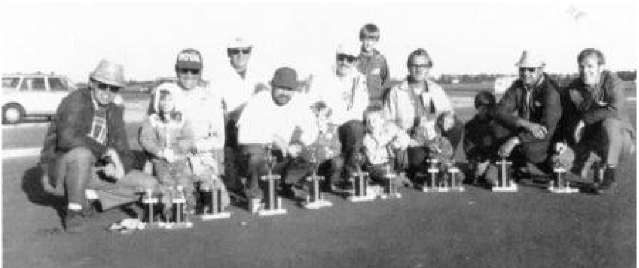
A group of MMAC members at a contest, with their winnings, 8 fliers, 11 trophies.