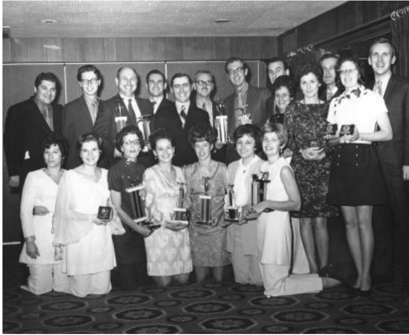
Members and their wives, with Club trophies won that year, at the annual Club banquet.