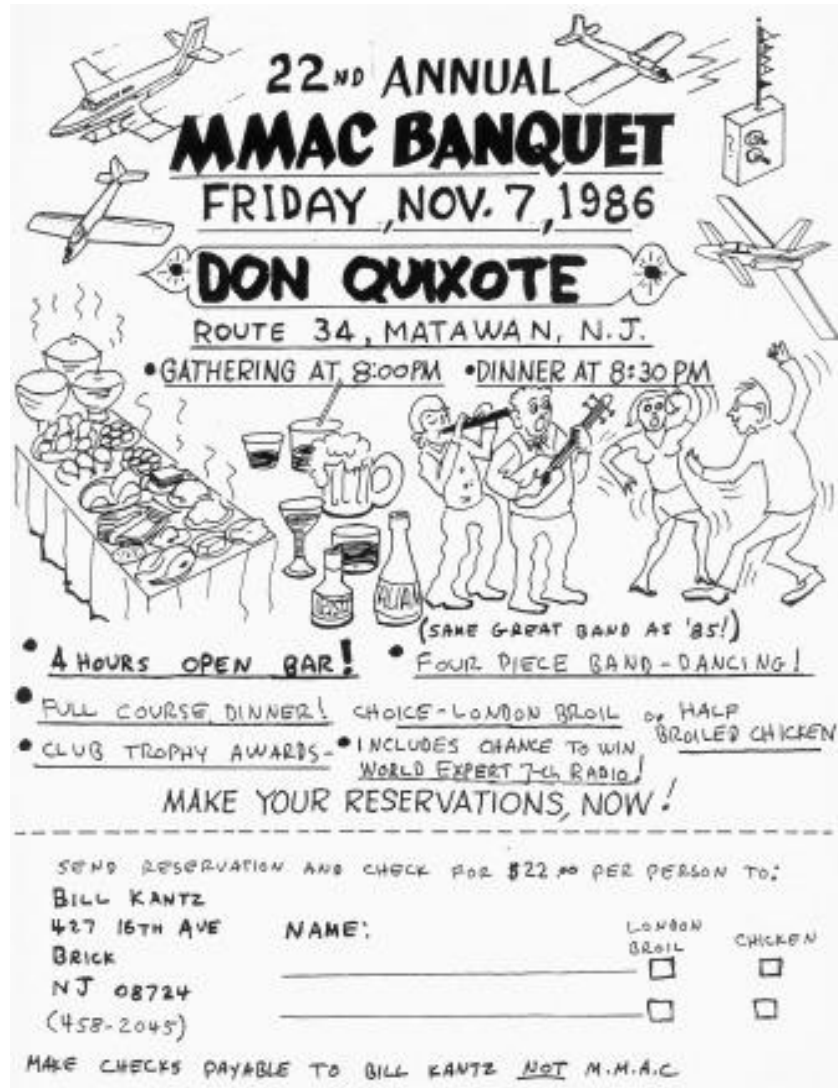
An announcement for one of the Club's early annual banquets.