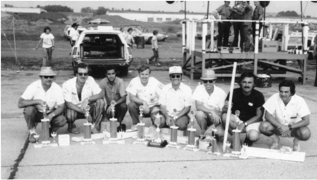
A group of MMAC members at a contest, with their trophies won that day.