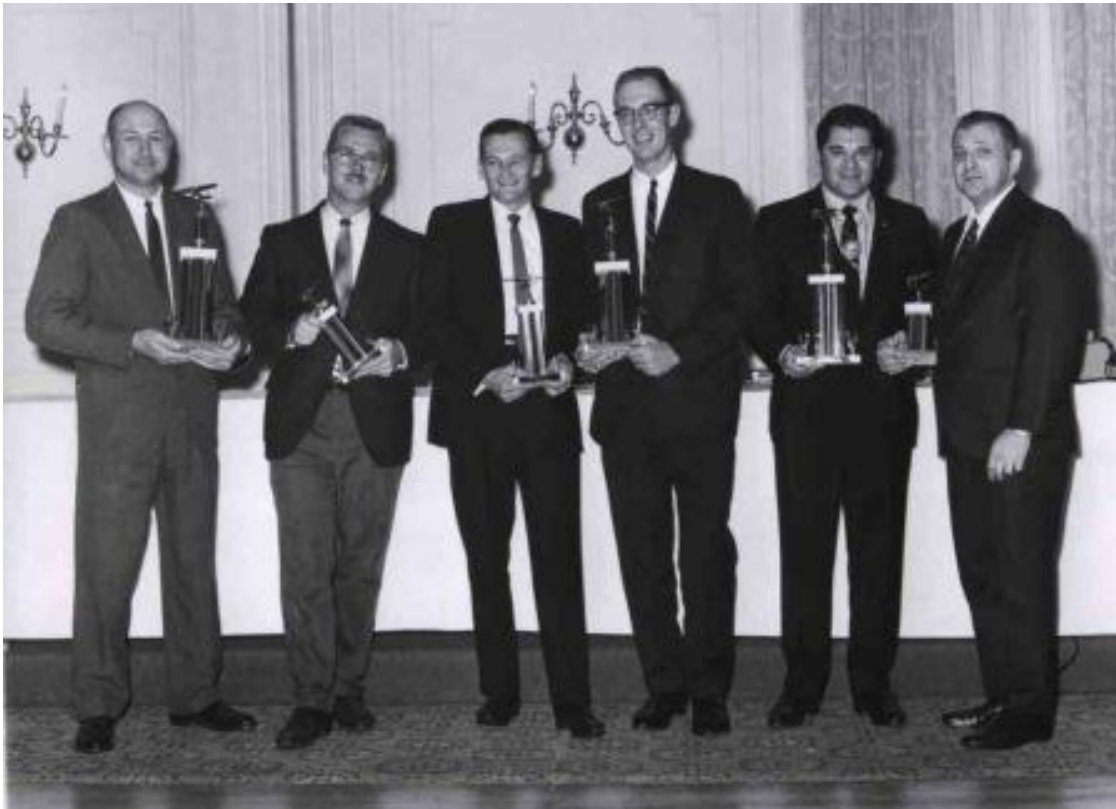
Club members and the trophies they won, at the Club's annual banquet.